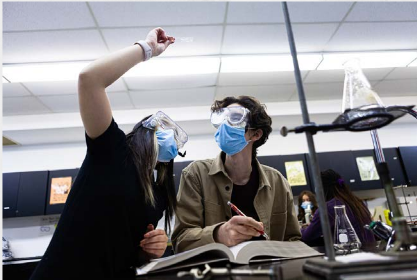
FUN IN SCIENCE CLASS