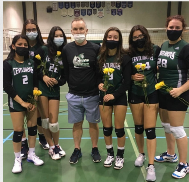
GRADE 12 GIRLS LAST VOLLEYBALL GAME