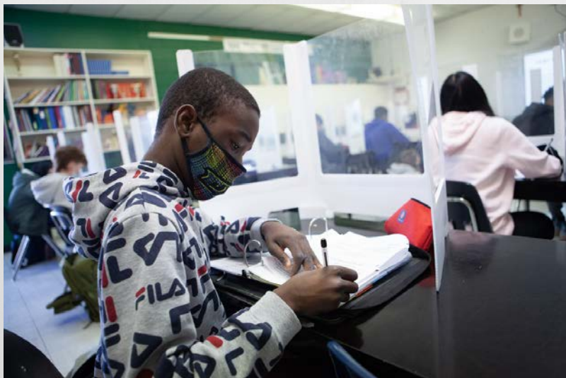
WORKING HARD DURING CLASS