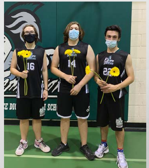
GRADE 12 BOYS LAST VOLLEYBALL GAME